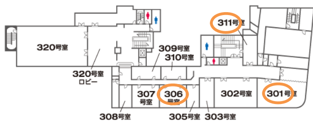
Floor Plan: 3rd Floor